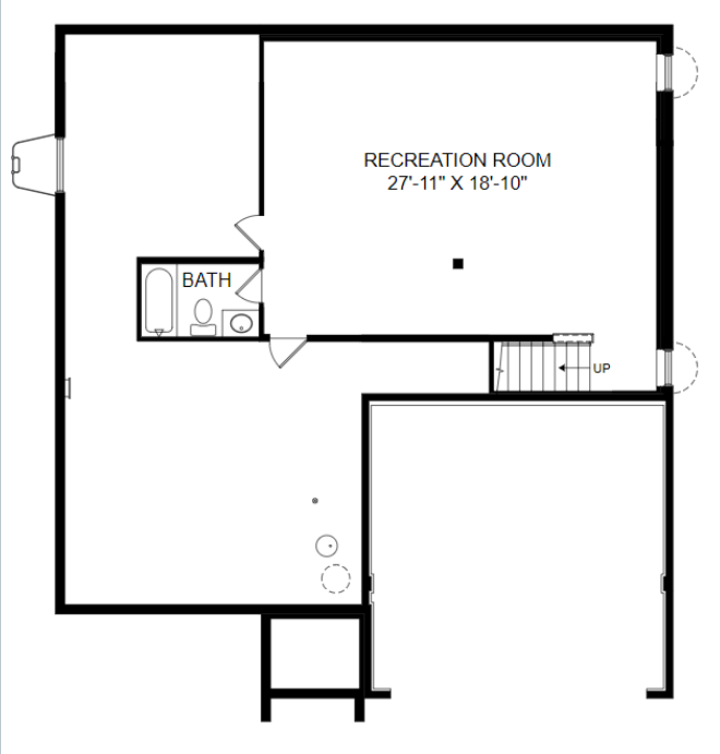
Lower Level Floor Plan