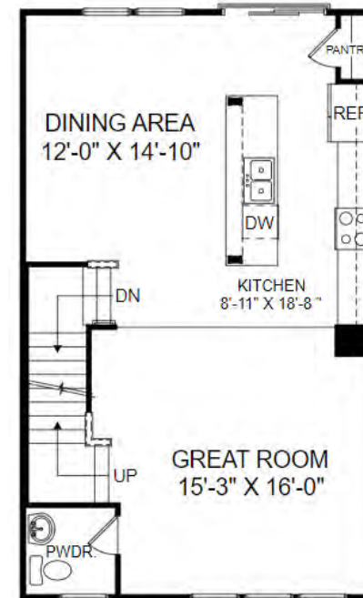
Main Level Floor Plan