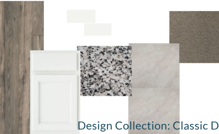
Design Collection: Classic D