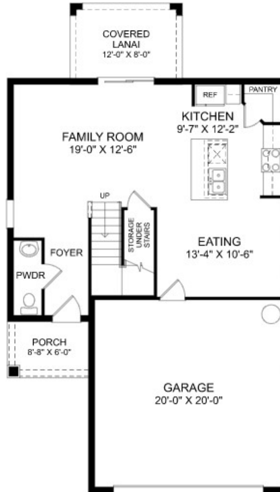
Main Level Floor Plan