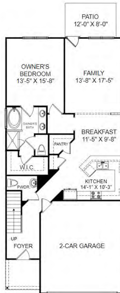
Main Level Floor Plan