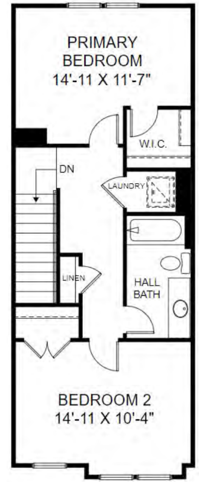
Upper Level Floor Plan