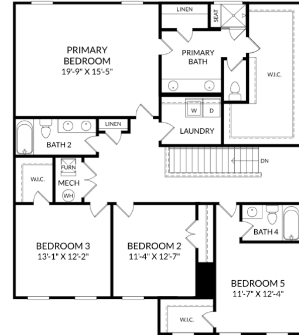
Upper Level floor plan

Prices, features and incentives are subject to change without notice. Photos used are for illustrative purposes only. Square footage is an approximation. Square footage is calculated to the outside of the framed walls or to the face of the brick on brick exteriors. It includes all conditioned spaces, except spaces under 5' in height. Site plan and home renderings are artist's concept only and elevation illustrations may include optional features. Actual product and specifications may vary in dimension or detail from these drawings and are subject to change without notice. It is recommended that the architectural blueprints be reviewed for clarification of features. Lot sizes, features and home sites are approximate and subject to change without notice. This brochure is for illustrative purposes only and is not part of a legal contract. Certain restrictions may apply. See a Neighborhood Sales Manager for details. ©Stanley Martin Homes, LLC | 07/2024 |