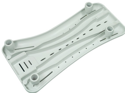
Bath Board x 1