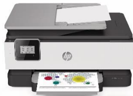
White + Basalt