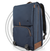
Lenovo 15.6" Laptop Urban Backpack B810