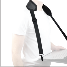
001025 Ergonomic shoulder strap with neck pad 2 attachment points