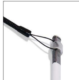
001033 - Pack of 10 Spiral cord & elastic tube