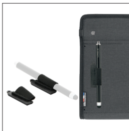
001081 Universal adhesive holder for stylus or pen