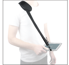
001093 Basic shoulder strap with 2 O rings 2 attachment points