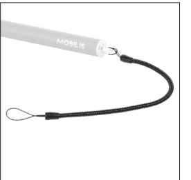
001032 - Pack of 10 Spiral cord