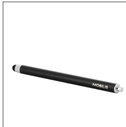
001053 Capacitive stylus per unit