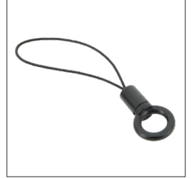
001091 - Pack de 2 O rings