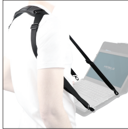
001024 Typing and transport shoulder strap 4 attachment point