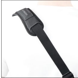
001027 Shoulder strap with break away system 2 attachment points