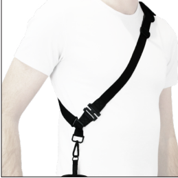
001084 Shoulder strap with break away system 1 attachment point