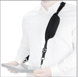
001092 Universal shoulder strap with secure system and expandable pocket 2 attachment points