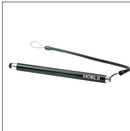
001054 - Pack of 10 Capacitive stylus & spiral cord