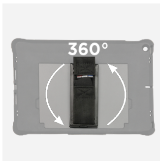
Rotating system 360°