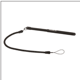
001030 - Pack of 10 Retractable capacitive styluses & spiral cord