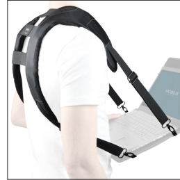
001026 Harness ergonomic shoulder strap 4 attachment points