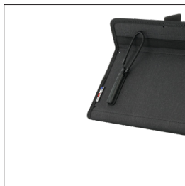
001080 - Pack of 10 Adhesive Stylus Holder with universal capacitive stylus and spiral cord