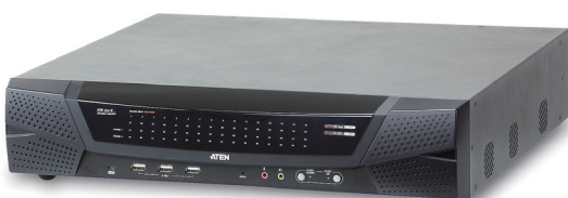
KN8164V Front View