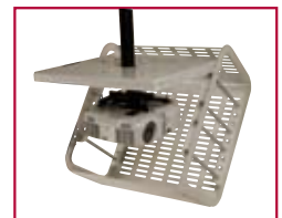
Maintenance Free Hook-n-Hang Feature

PROJECTOR SAFETY All-steel construction for durable protection