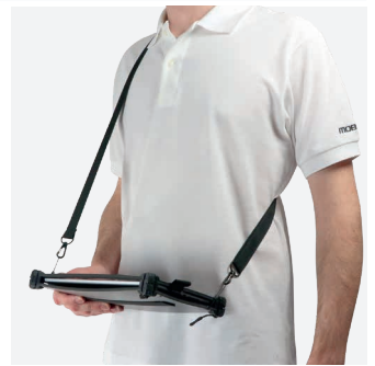
For typing in standing position