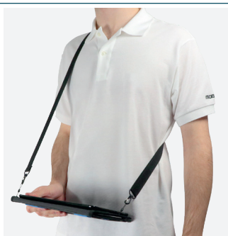
For typing in standing position