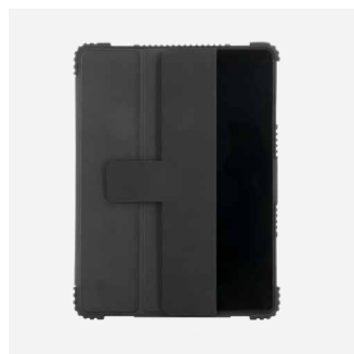
Anti-scratch interior fabric