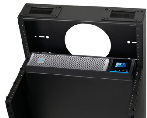
5PX G2 UPS mounted vertically in the MiniRaQ by Eaton, perfect for confined places