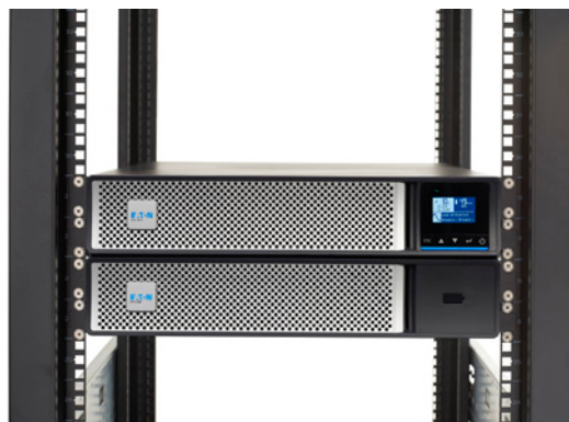
5PX G2 4-post mounting kits are rated (ISTA 3E) to support the weight of a UPS/EBM when mounted in a rack and being transported