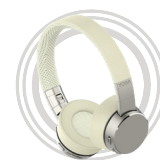
Lenovo Yoga Active Noise-cancellation Headphones