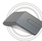
Lenovo Yoga Mouse with Laser Presenter