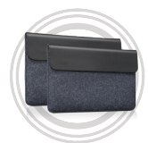
Lenovo Yoga Sleeves (14" and 15")

* Example of Lenovo catalogue naming convention