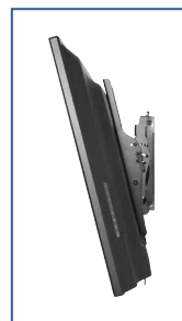
+15°/-5° of tilt for versatile viewing angles.