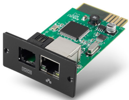
Management card: APV9601