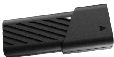
A1 Mini LED controller

An enhanced loop dynamic bearing system keeps things running silently smooth.