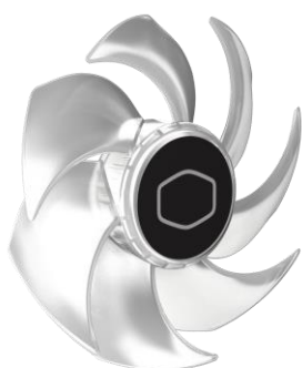
Enhanced fan blade

An improved fan blade provides higher fan speed, air pressure, and airflow while sticking to the same low noise level the SickleFlow is known for.