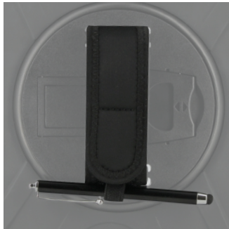
Intregated on the hand strap Stylus not icluded