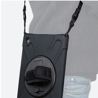
Shoulder strap included