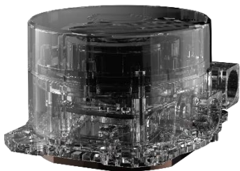
New Dual Chamber Gen S

Water flow and pressure have been enhanced in combination with the new customized copper base to precisely target heat spots.