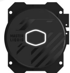
Classic Design Tone

Increased surface area of the radiator fins improve heat dissipation.