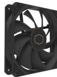
New 120 Fan

Included premium CryoFuze thermal paste for even better heat conductivity.