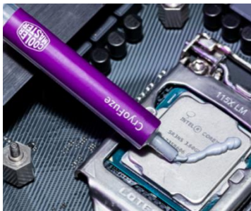
CryoFuze Thermal Paste

New design elements refresh the aesthetics for a classic minimalist look.