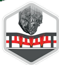
The first layer of resistance