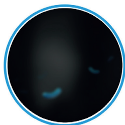
Impactthane protected after 2 hours Up to 99% microbes killed