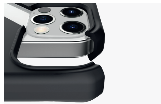
Protect your screen and camera lens

Our ion anti-microbial technology works at a cellular level to continually disrupt the growth and reproduction of micro-organisms. This creates a multi-point attack, damaging the protein, cell membrane, DNA and internal systems of bacteria, and many common viruses.