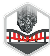
Adding resistance on impact with the second layer

Using air as a mattress to absorb the shocks, the honeycomb - design micro air pockets now have an extra layer that enables a 2 Step resistance against Kinetic energy generated if you drop your phone.