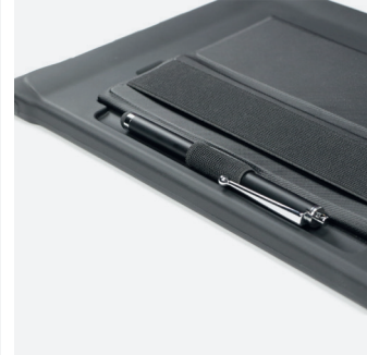
*Stylus not included