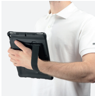
Portrait / Landscape layout