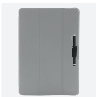
Stylus not included