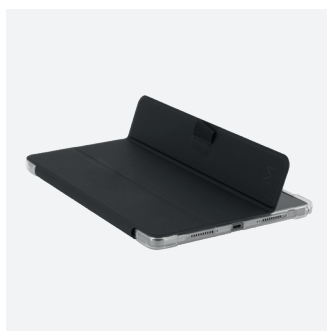
Automatic sleep &amp; wake mode