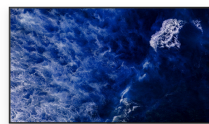
Sony BZ53L with DEEP BLACK NON-GLARE

Combining anti-glare & low reflection technology for haze without compromise. Reflections are minimised while maintaining colour, clarity and viewing angle.