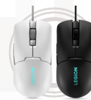
Lenovo Legion M300s RGB Gaming Mouse