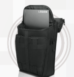
Lenovo Legion Active Gaming Backpack