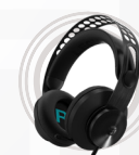
Lenovo Legion H300 Stereo Gaming Headset