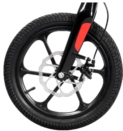
16" Air-Filled Tires