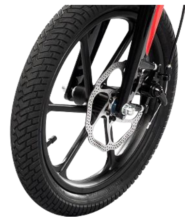
Dual Disc Brakes