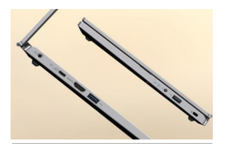
The Connectivity Connect or charge your newest devices on the full-function USB Type-C port and a HDMI port to increase the whole family's productivity and functionality.

The Aspire 3 is ready-to-go with the latest AMD Ryzen<sup>TM</sup> 5 7520U Processor with Radeon<sup>TM</sup> Graphics—ideal for the entire family, with performance and productivity at the core. Perfect to get more out of work, study, or play.