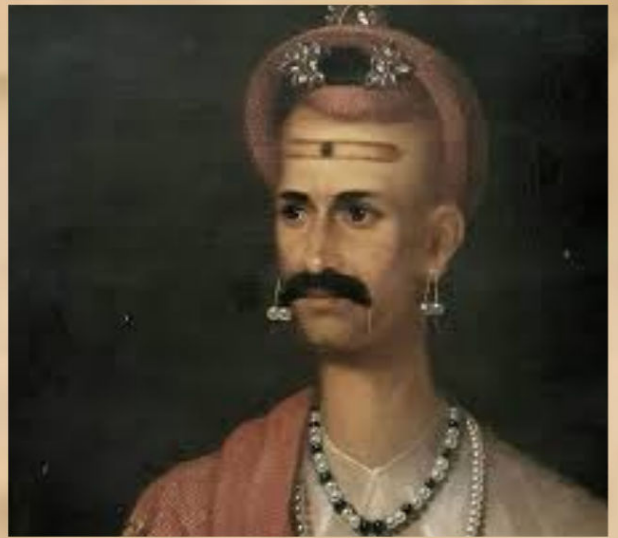
NANA FADNAVIS FOUGHT BRAVELY AGAINST BRITISHERS