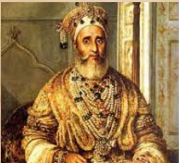
BAHADUR SHAH JAFAR WAS IMPRISONED IN THE RANGOON JAIL AND DIED THERE IN 1862.