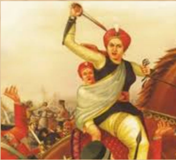
RANI LAKSHMI BAI FOUGHT TILL HER LAST BREATH.