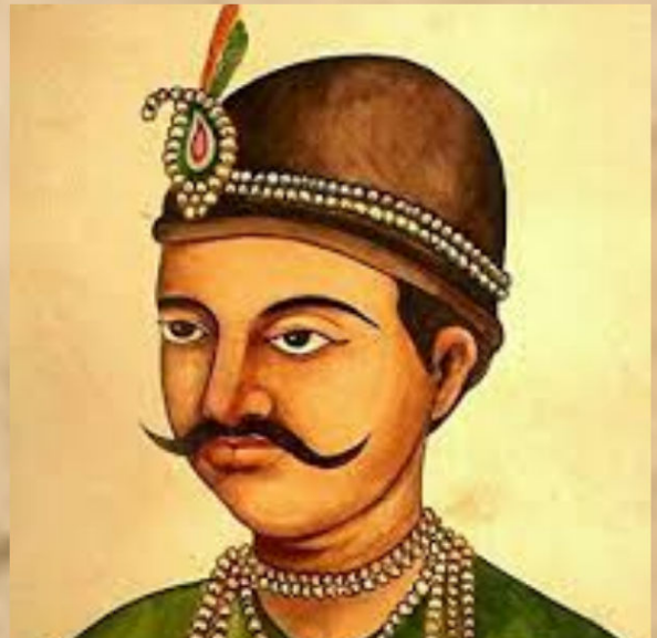
TATIYA TOPE'S DEAD BODY WAS THROWN TO HIS COURT