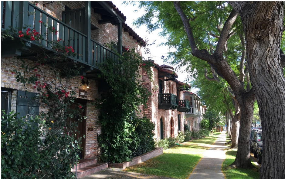
Small multifamily rental buildings in the Los Angeles area. These are the kinds of buildings that landlords are currently converting to TICs.