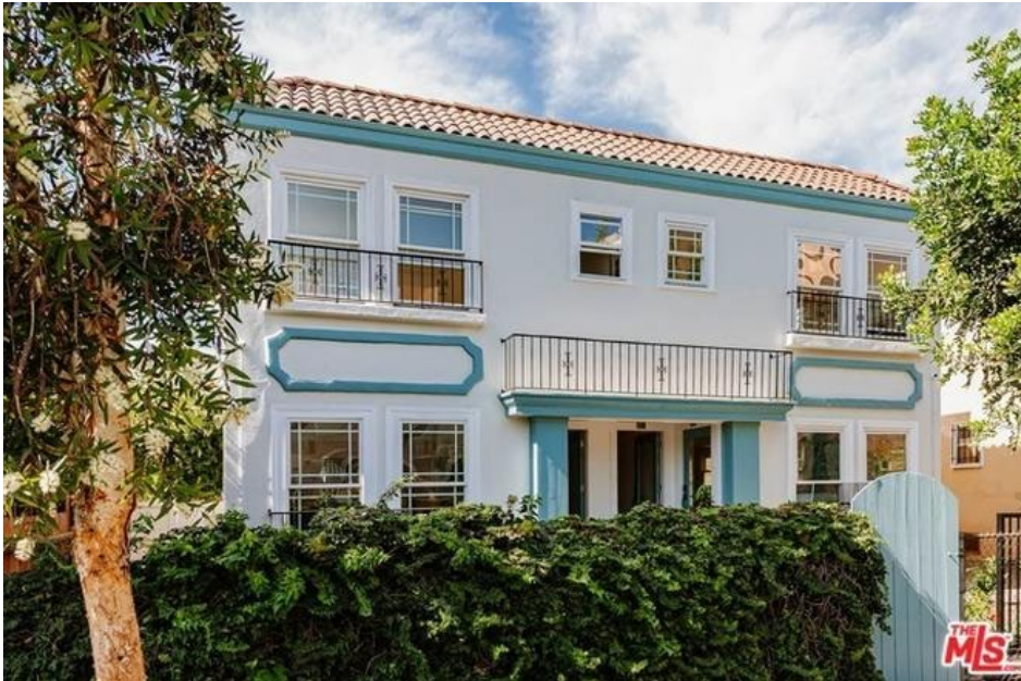
The exterior of the fourplex where the Hollywood TIC is located.

He also said that while co-ops are sometimes massive buildings with hundreds of units, TIC buildings tend to be smaller. Case in point: Stanley’s Hollywood apartment listing, which was in a building of only four units.