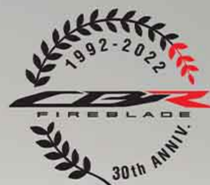
Honda CBR1000RR-R SP 30th Anniversary Tricolor